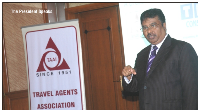
The President Speaks