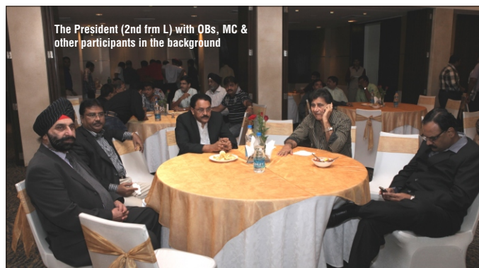
The President (2nd from L) with OBs, IMC & other participants in the background